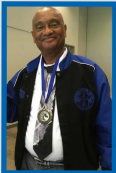
FLORIDA FOOTBALL HALL OF FAMERS OF FAYETTEVILLE STATE UNIVERSITY